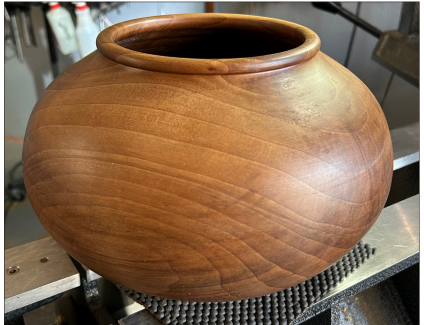
Gonzalo de la