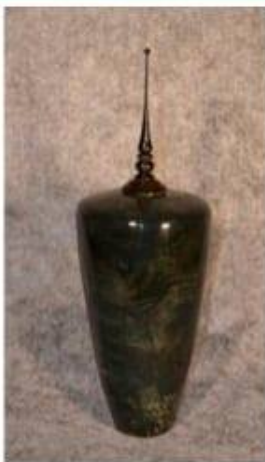
Cap'n Eddie Castelin