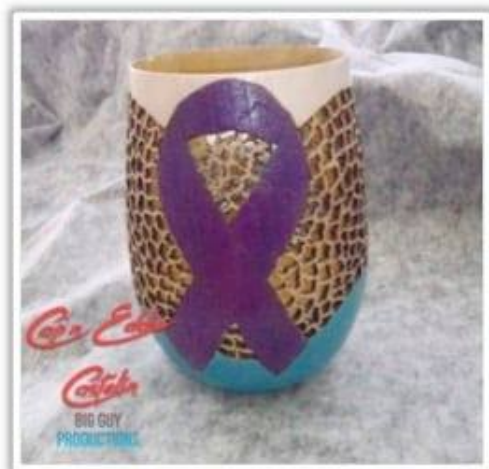
An ornamented vase developed for a friend's fund raiser. He was fighting cancer.