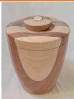
Beads of Courage

Being a little older, I'm very fortunate to have someone call and check on me every day. He is from India and is very concerned about my car warranty.