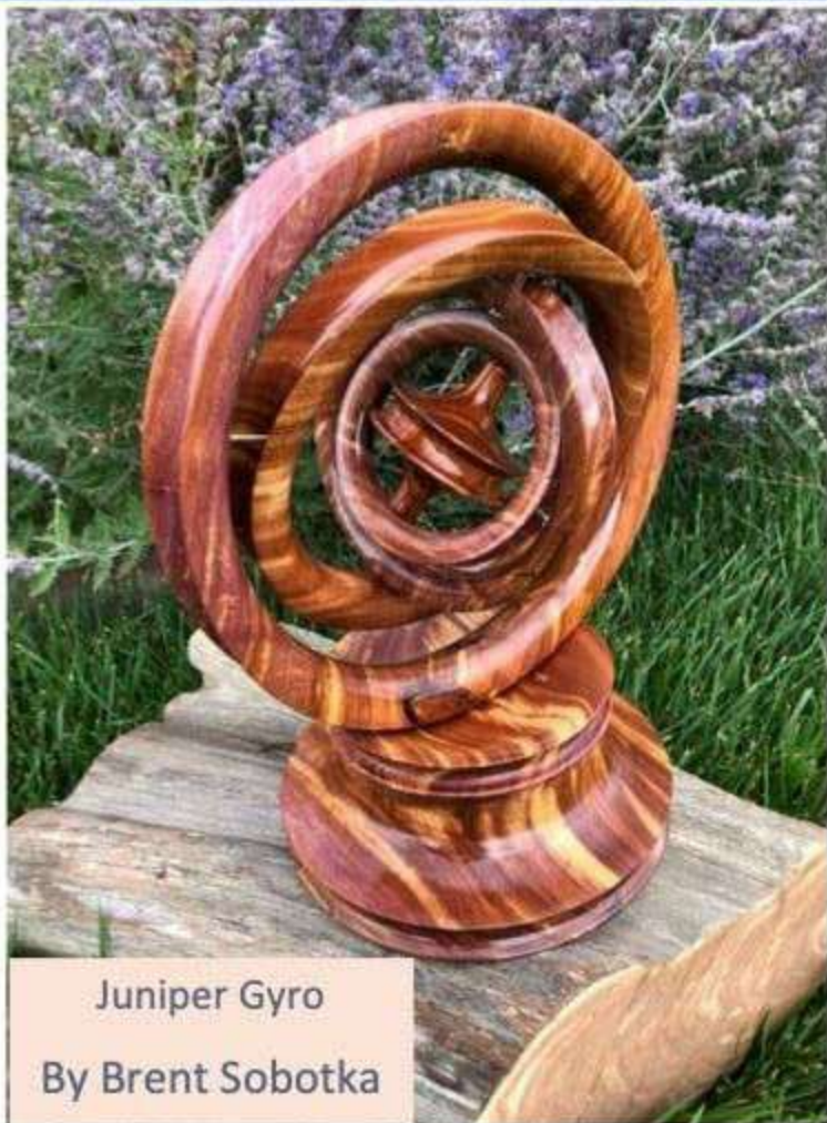
Juniper Gyro

Just seeing this is a pleasant journey for the eyes.