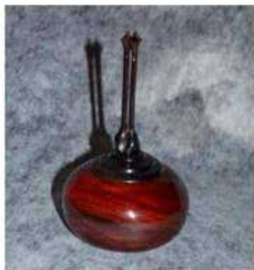
Cap'n Eddie Castelin