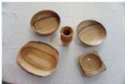
Juan Carlos Pepper

Research has shown that laughing for 2 minutes is just as healthy as a 20 minute jog. So now I'm sitting in the park laughing at all the joggers.