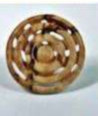
Examples of pendants displayed at Swat and the internet.